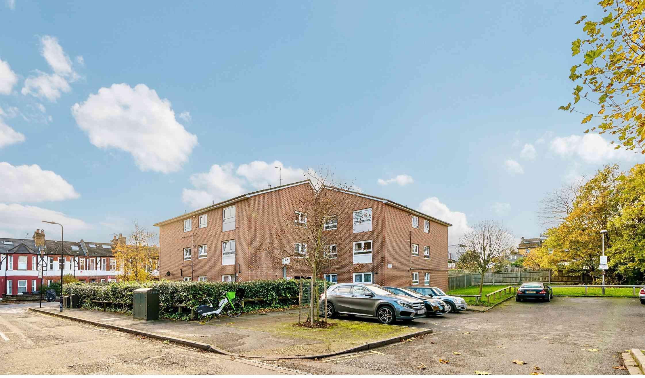
Wilkinson Way, London, W4 5XA