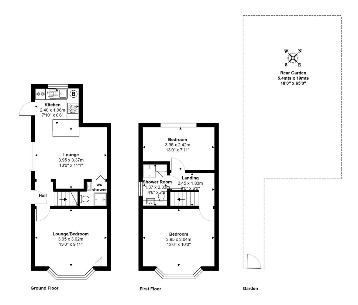
Total Area: 67.6 m² ... 728 ft²

All measurements are approximate and for display purposes only.