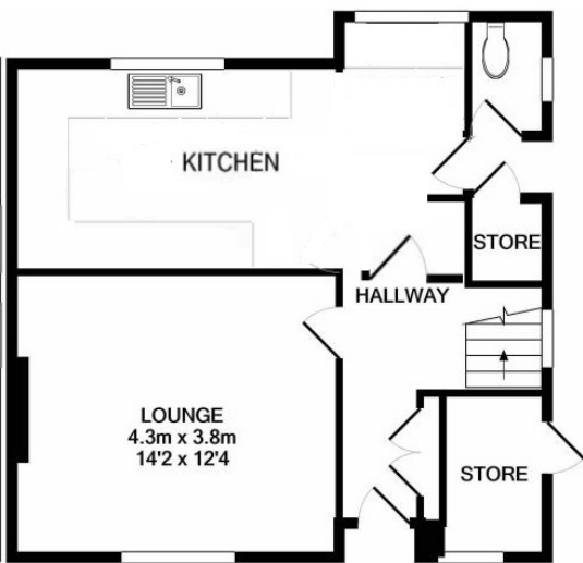
GROUND FLOOR APPROX. FLOOR AREA 46.1 SQ.M. (497 SQ.FT.)