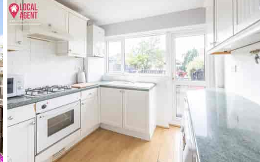
96 Swanley Road, Welling, Kent, DA16 1LJ £400,000 Freehold