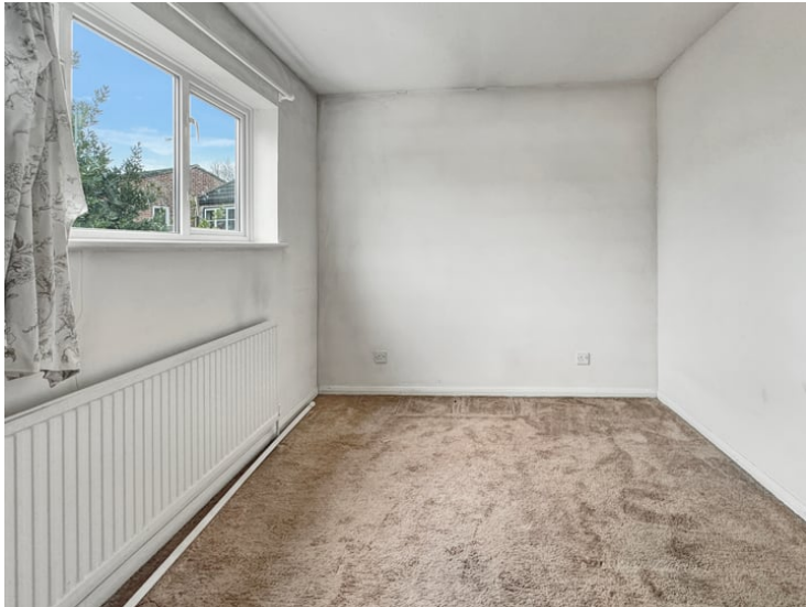
11' 10" x 8' 5" (3.61m x 2.57m) Window to rear, radiator, fitted cupboard.