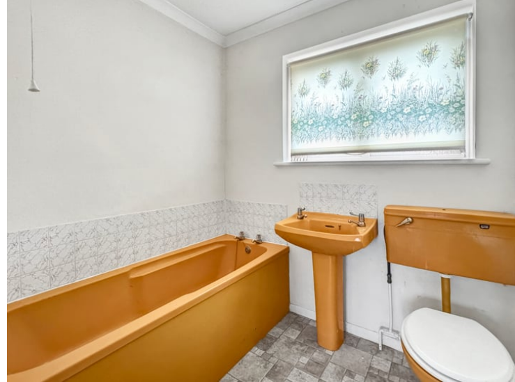
Window to rear, panel bath, pedestal wash hand basin, low level WC.