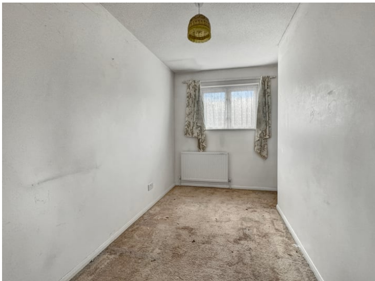
11' 8" x 6' 0" (3.56m x 1.83m) Window to front, radiator, fitted storage.