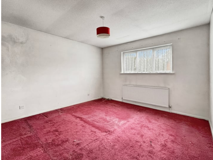
11' 10" x 11' 9" (3.61m x 3.58m) Window to front, radiator.