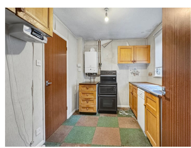
9' 8" \times 7' 8" (2.95m \times 2.34m) Window to rear, door to dining room, wall mounted Baxi boiler, spaces for appliances, fitted units, fitted sink, matching eye level units.