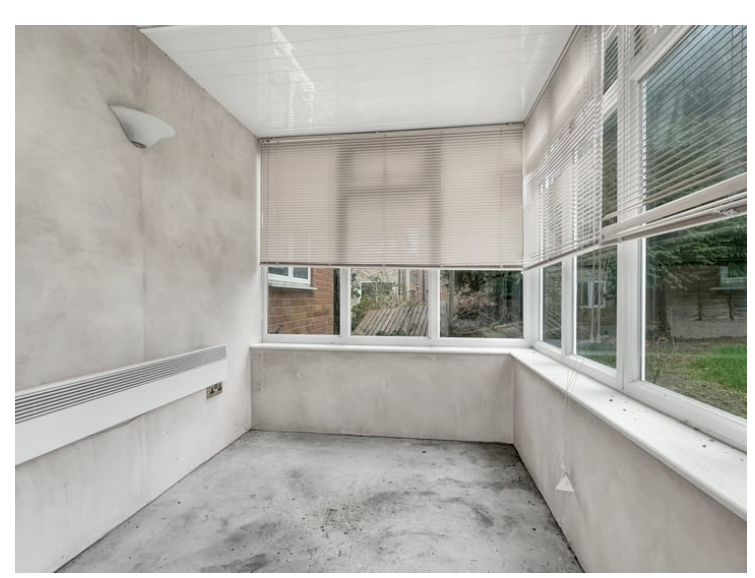
7' 10'' x 6' 10'' (2.39m x 2.08m) Accessed only from the garden, brick built with Upvc sides and sliding patio door, electric heater.