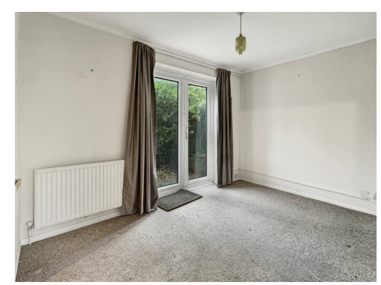
11' 4\text{"}\times7\text{'} 8" (3.45m x 2.34m) French doors to rear, radiator, doors to kitchen and living room.