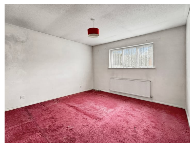
11' 10" x 11' 9" (3.61m x 3.58m) Window to front, radiator.