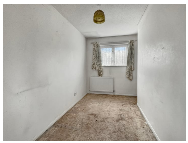
11' 8" x 6' 0" (3.56m x 1.83m) Window to front, radiator, fitted storage.