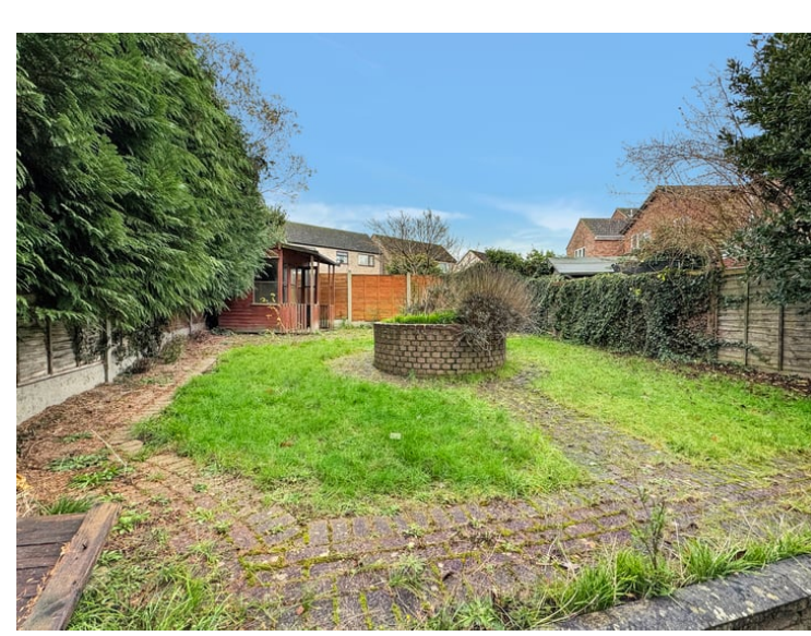
Front garden is laid to lawn and enclosed by dwarf walling. Rear garden is enclosed by fencing, mainly laid to lawn, patio area, gated side access, feature flower bed, summer house to remain.