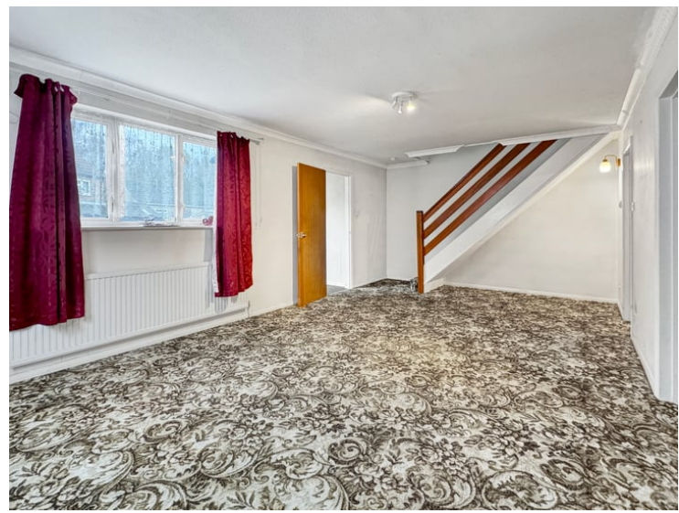
21' 7" x 12' 1" (6.58m x 3.68m) Windows to front and side, two radiators, stairs to first floor, doors to kitchen and dining room.