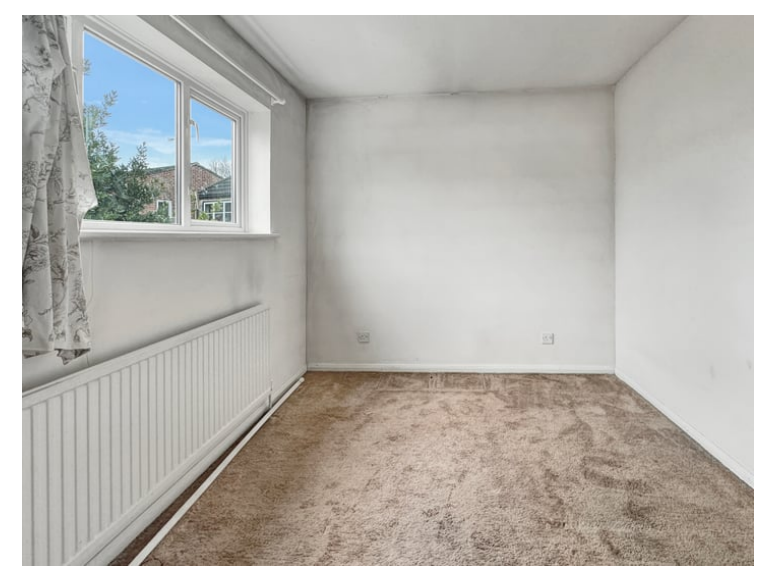
11' 10" x 8' 5" (3.61m x 2.57m) Window to rear, radiator, fitted cupboard.