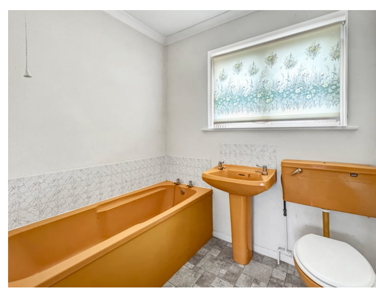
Window to rear, panel bath, pedestal wash hand basin, low level WC.