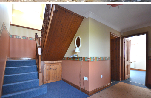
Capel Cottage, Marham Road, Narborough, King's Lynn, Norfolk PE32 1SU