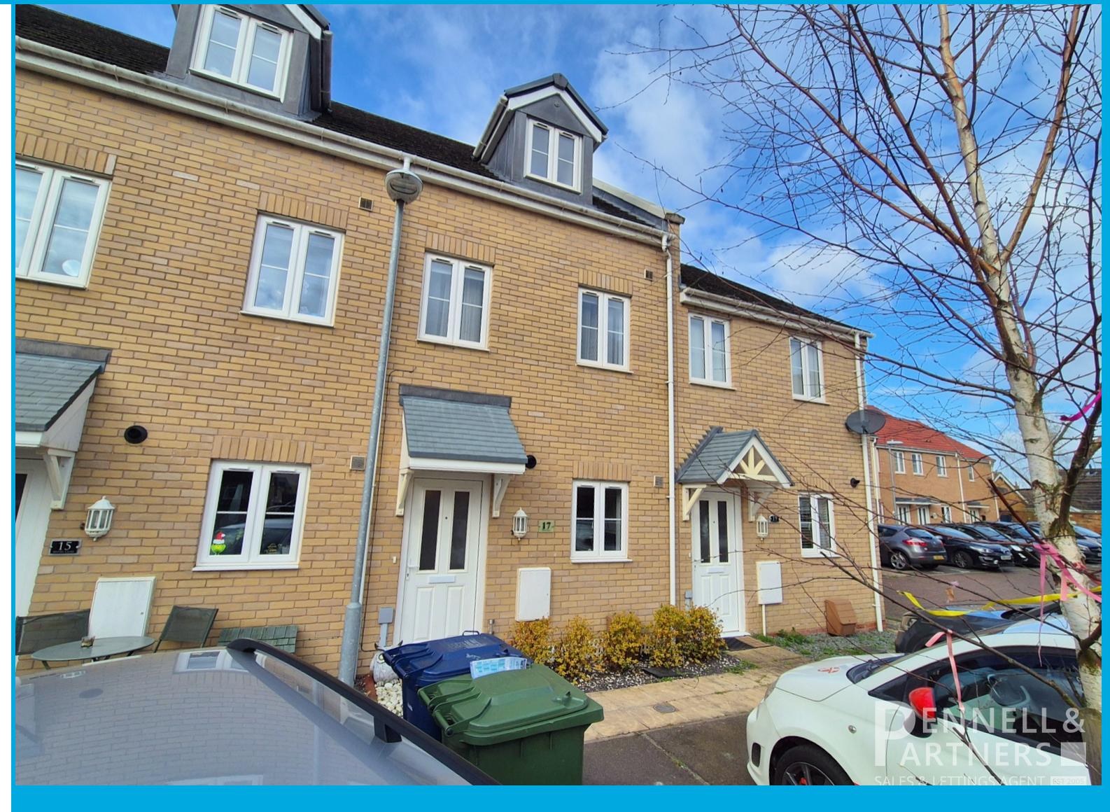
17 WITTEL CLOSE, WHITTLESEY, PETERBOROUGH, CAMBRIDGESHIRE. PE7 1HN