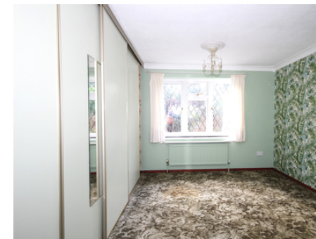
6 Mimram Close, Whitwell, Hitchin, Hertfordshire, SG4 8HR