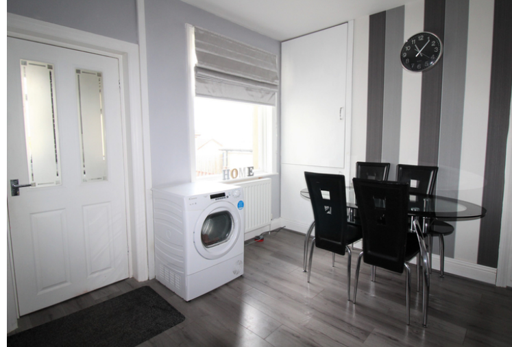
Offers In The Region Of £120,000