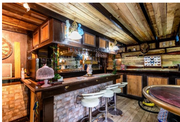
CAR PORT AND BAR