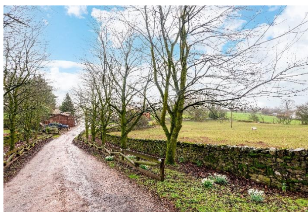
PADDOCK + DRIVEWAY