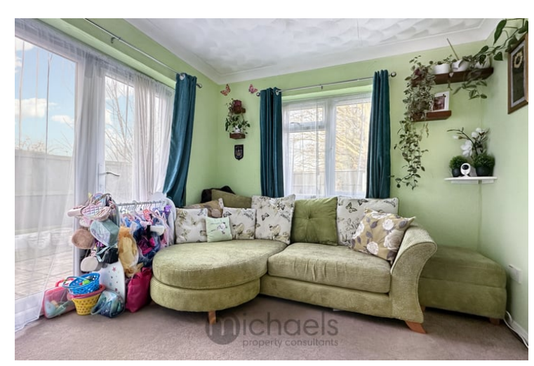
11' x 9'4" (3.35m x 2.84m) UPVC doors leading to the garden, UPVC window to rear aspect.