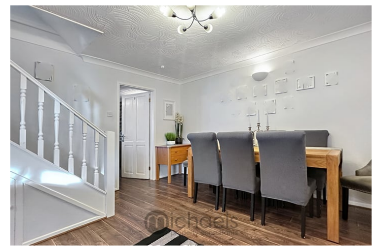
12'10'' \times 12' (3.91m x 3.66m) With stairs leading to first floor, storage cupboard under, radiator.