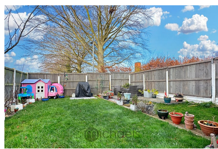
There is a garage with driveway parking. Side gate leading to rear garden, which commences with a paved patio area whilst the remainder is mainly laid to lawn with a decking area to the rear and enclosed by panelled fencing.