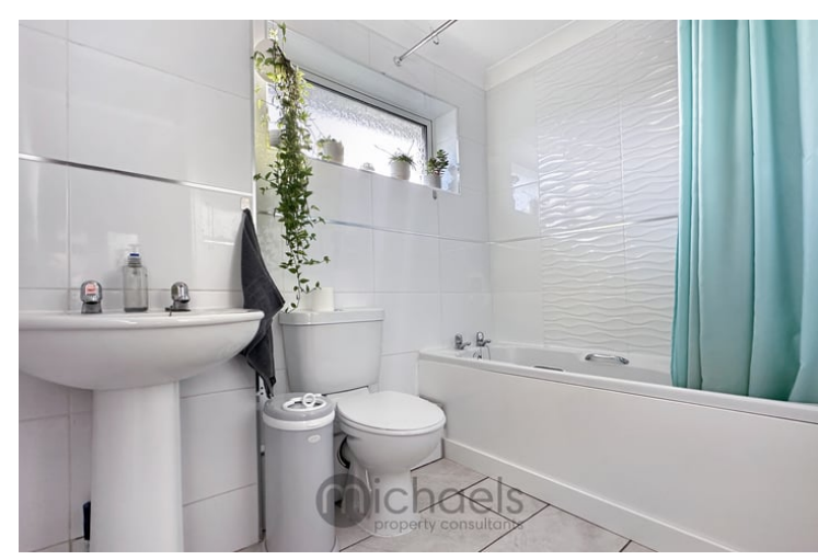
7'7" x 5'6" (2.31m x 1.68m) With a panel enclosed bath with shower over, low level WC, wash hand basin, radiator, UPVC window to front aspect.