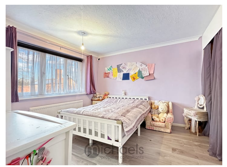
11'4" \times 10'10" (3.45m x 3.3m) UPVC window to rear aspect, radiator