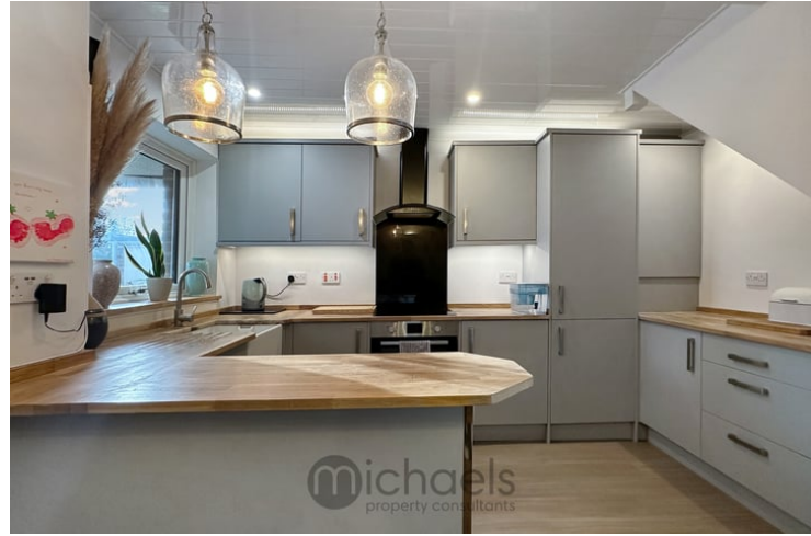
11'10" \times 7'1" (3.61m x 2.16m) With a range of wall and base units, sink and drainer unit, integrated appliances, wall mounted boiler, UPVC window to front