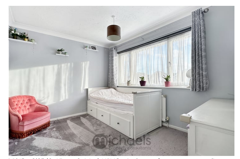
11\mbox{'4"} x 8\mbox{'8"} (3.45m x 2.64m) UPVC window to front aspect, radiator, two built in storage cupboards.