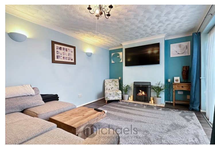
18'4" \times 10'7" (5.59m x 3.23m) UPVC doors to rear aspect, gas fire, radiator, double doors to study.