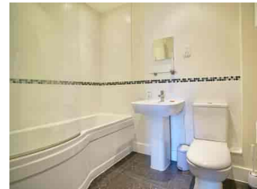
Thrapston Road, Brampton PE28 4QR