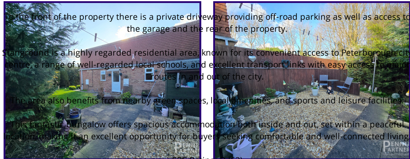
EPC Rating: D (63)

Externally, the property continues to impress with a wrap-around garden that offers a good degree of privacy thanks to established borders and planting. The garden features a combination of lawn, patio seating areas, and well-stocked planting beds, creating an attractive and versatile outdoor space to enjoy throughout the year.