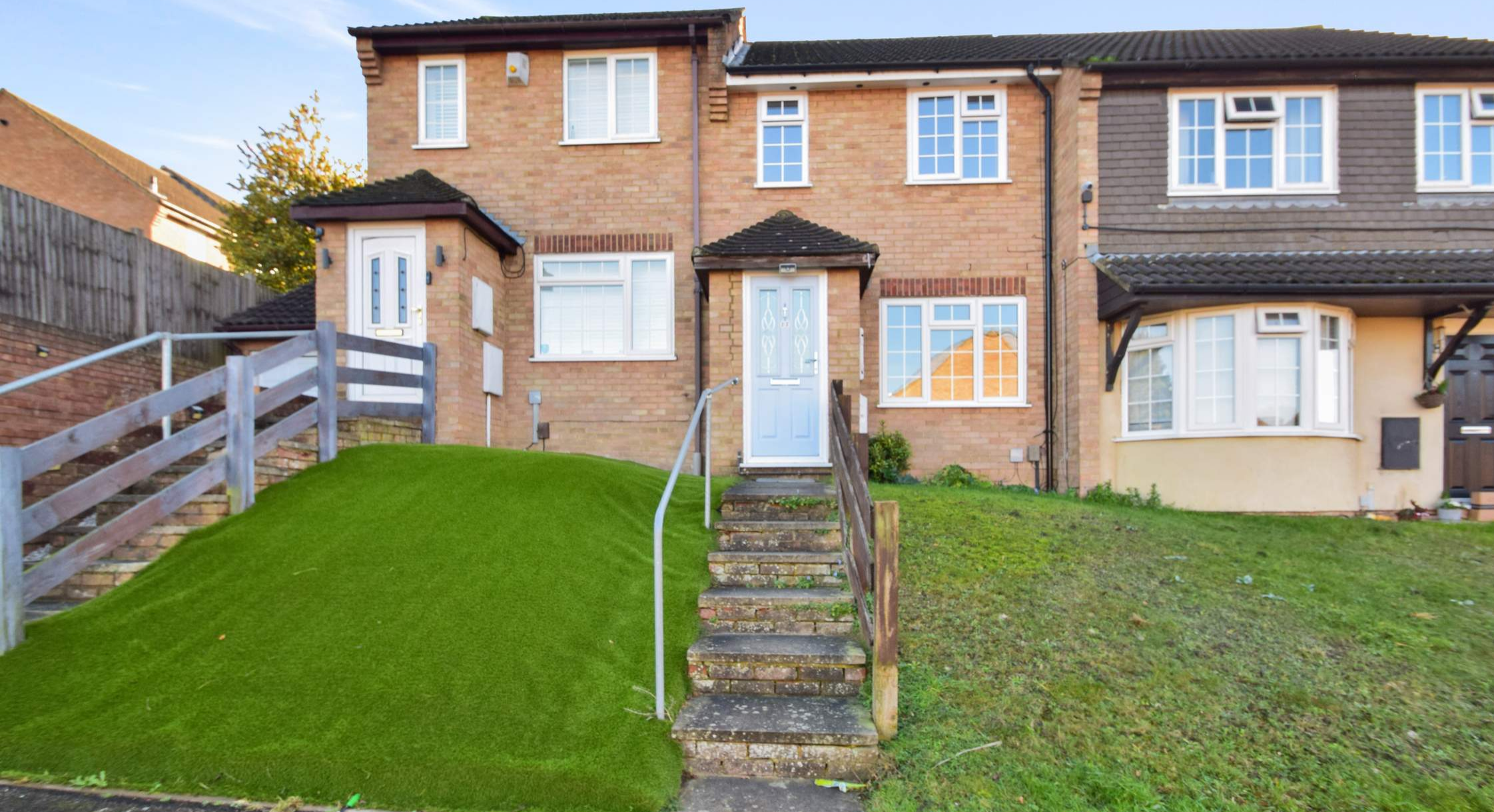
Two Bedroom Terraced House Emily Road, Walderslade, Chatham, Kent, ME5 7LF