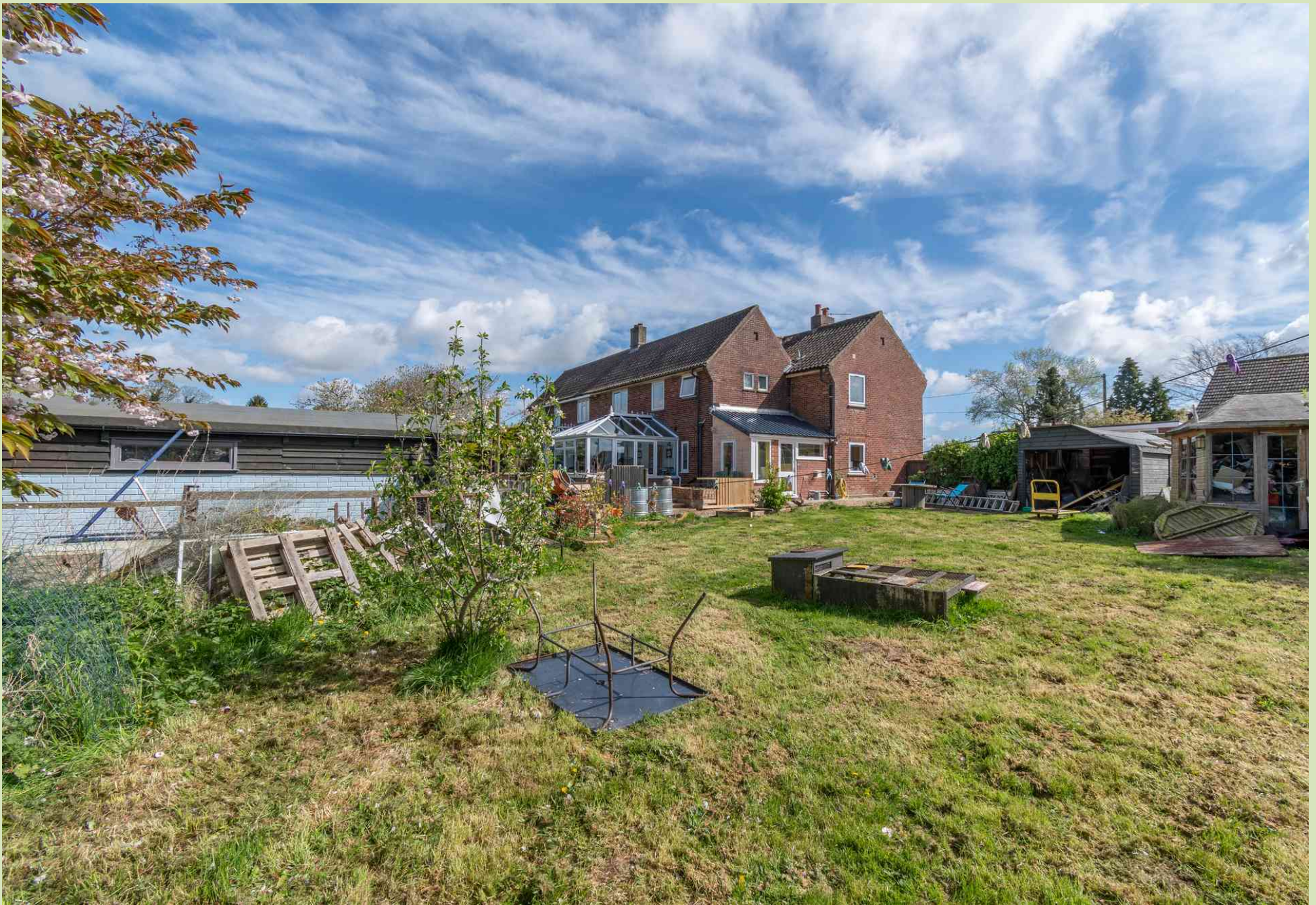
1 Coronation Villas, Shereford Guide Price £400,000