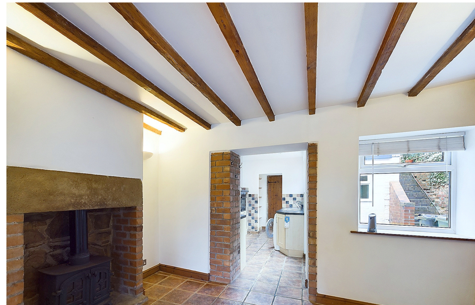
Nottingham Road, Belper, Derbyshire DE56 1JH £220,000 - Freehold