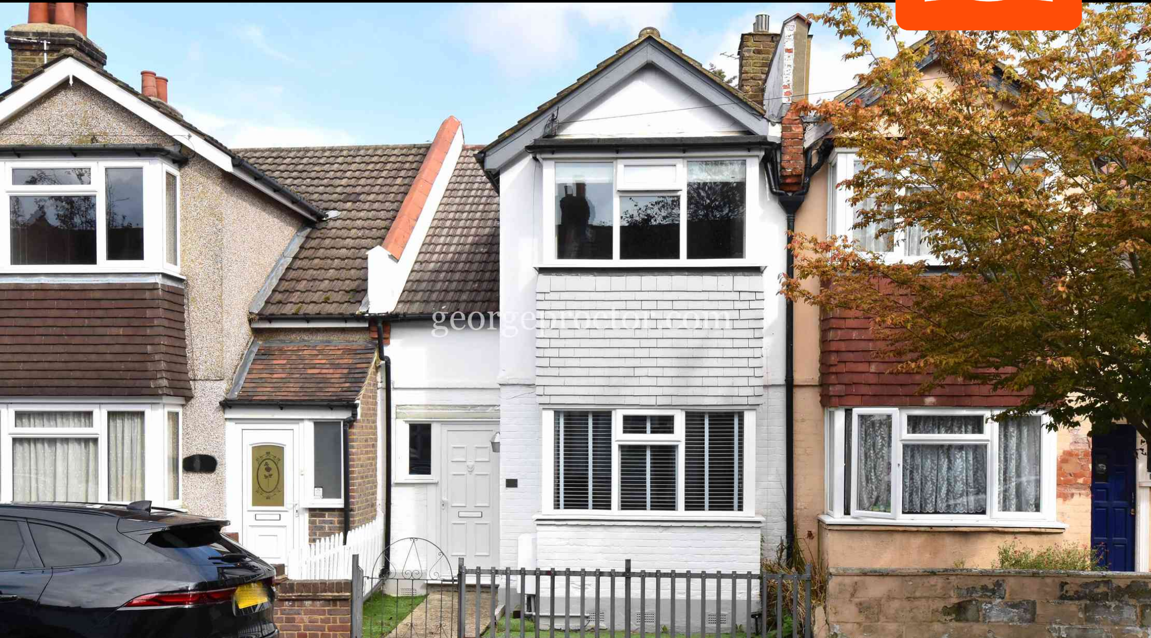
Haywood Road, Bromley, Kent. BR2 9RQ