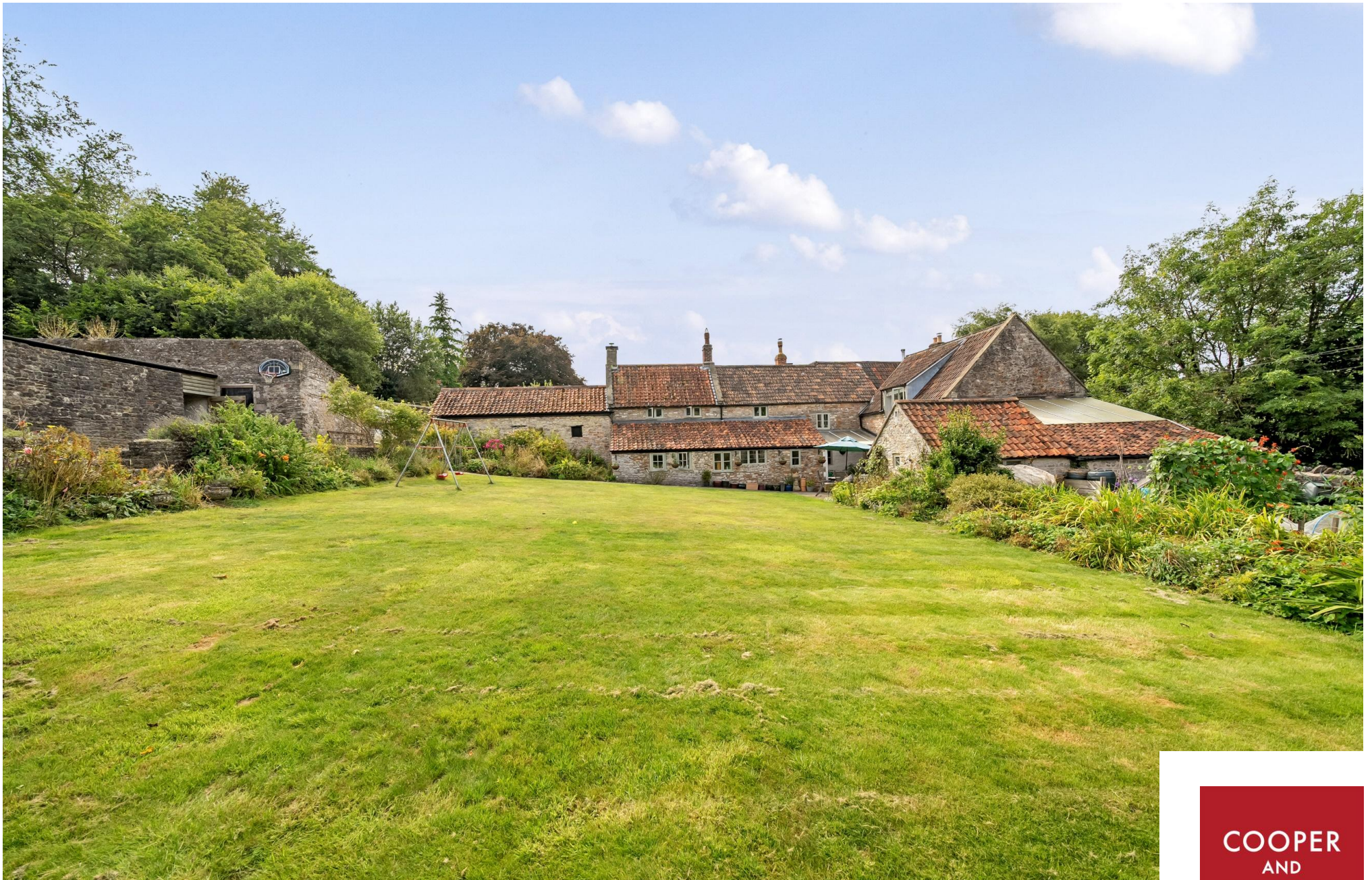
Parsonage Farm, Croscombe, Nr Wells, BA5 3QN