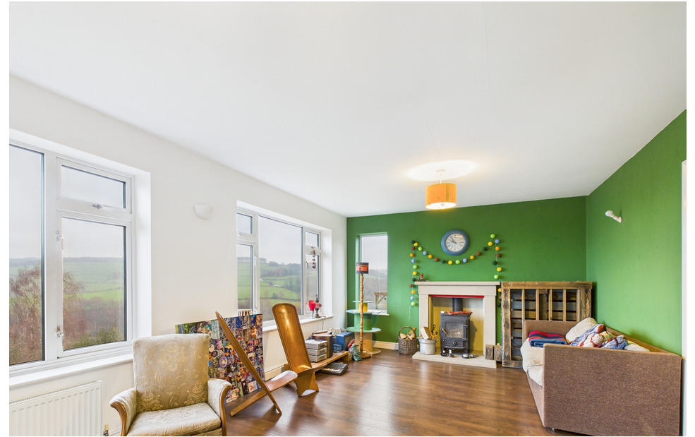
26 Newbridge Road, Ambergate, Belper, Derbyshire DE56 2GR £400,000 - Freehold