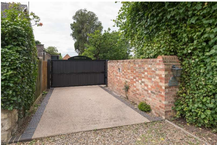
Abbey View, Church End Elstow, Bedfordshire MK42 9XT