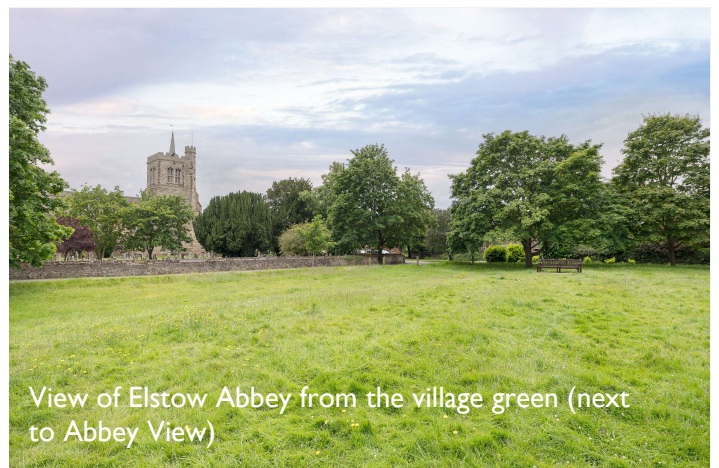
View of Elstow Abbey from the village green (next to Abbey View)