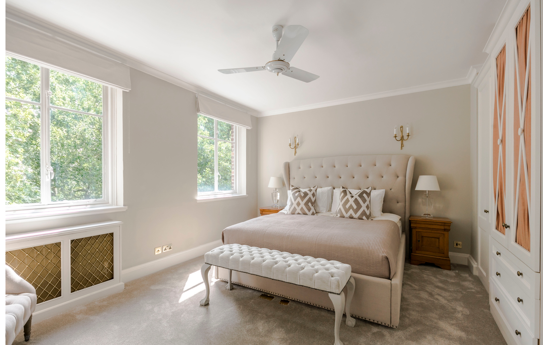
Flat 16, 33 Bryanston Square, Marylebone, London, W1H 2DX £3,200 p/w