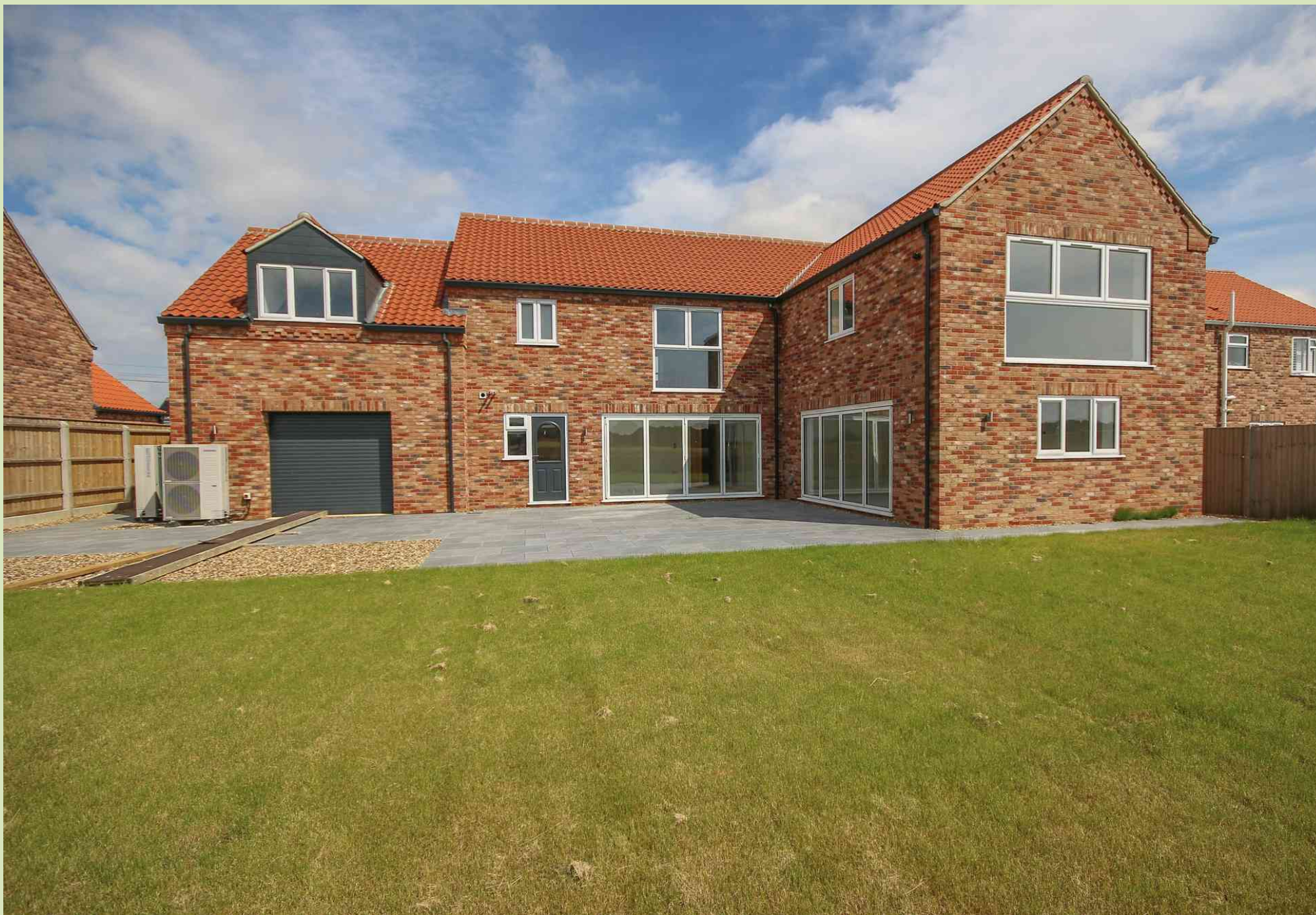
68 Gayton Road, East Winch Guide Price £750,000