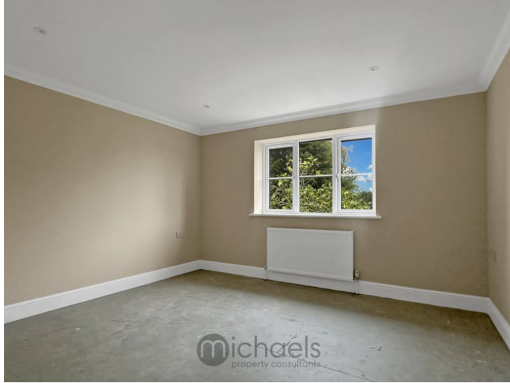
18' 0" x 12' 9" (5.49m x 3.89m) UPVC window to front.