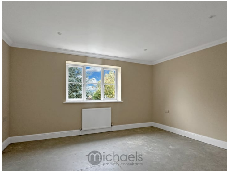
14' 3" x 11' 9" (4.34m x 3.58m) UPVC window to rear.