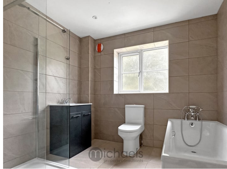
8' 6" x 8' 6" (2.59m x 2.59m) Three piece suite.