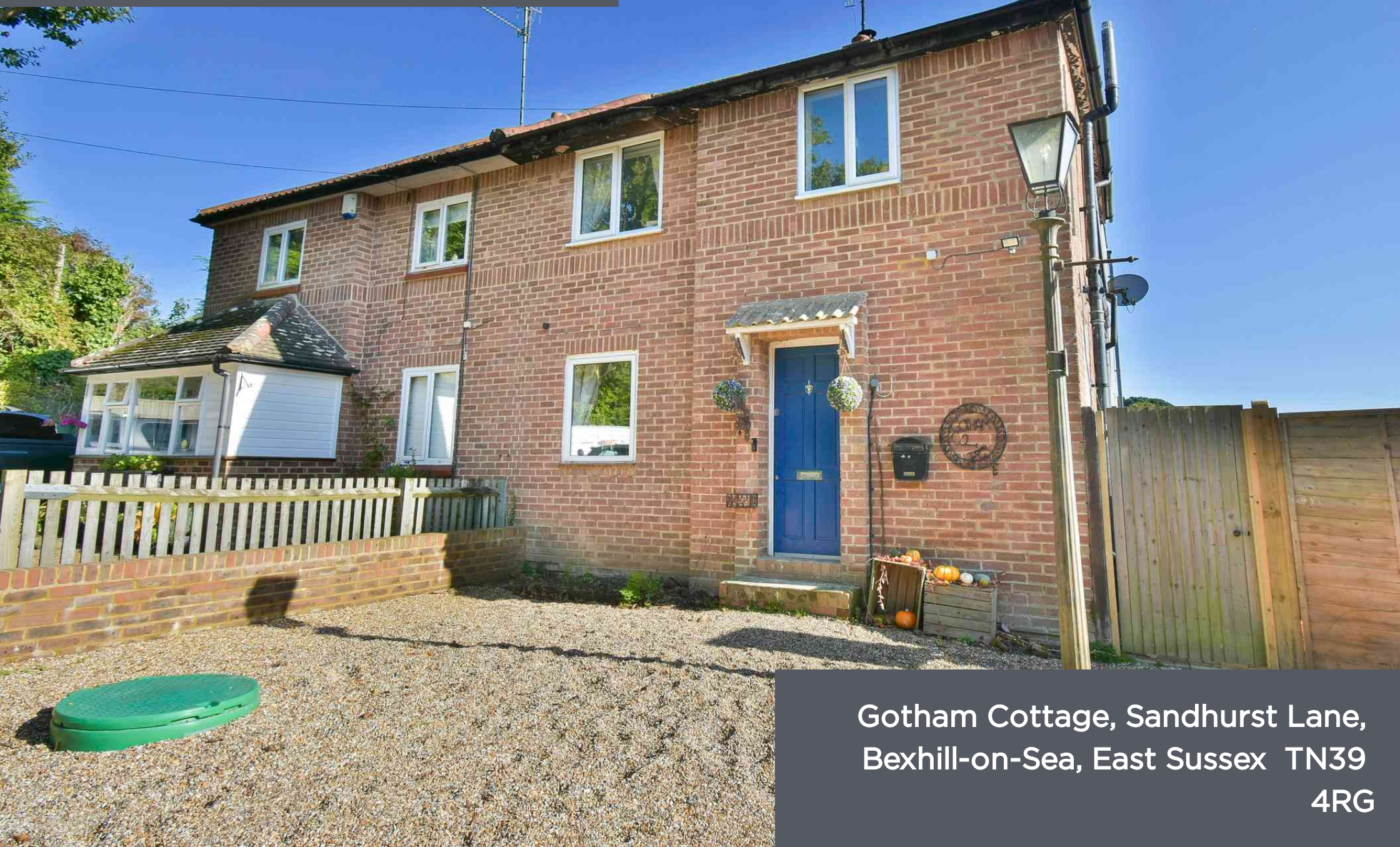
Gotham Cottage, Sandhurst Lane, Bexhill-on-Sea, East Sussex TN39 4RG