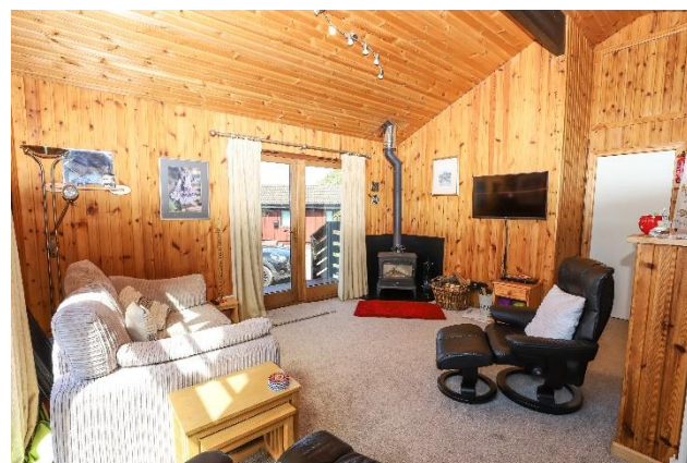
OPEN PLAN LIVING DINING KITCHEN