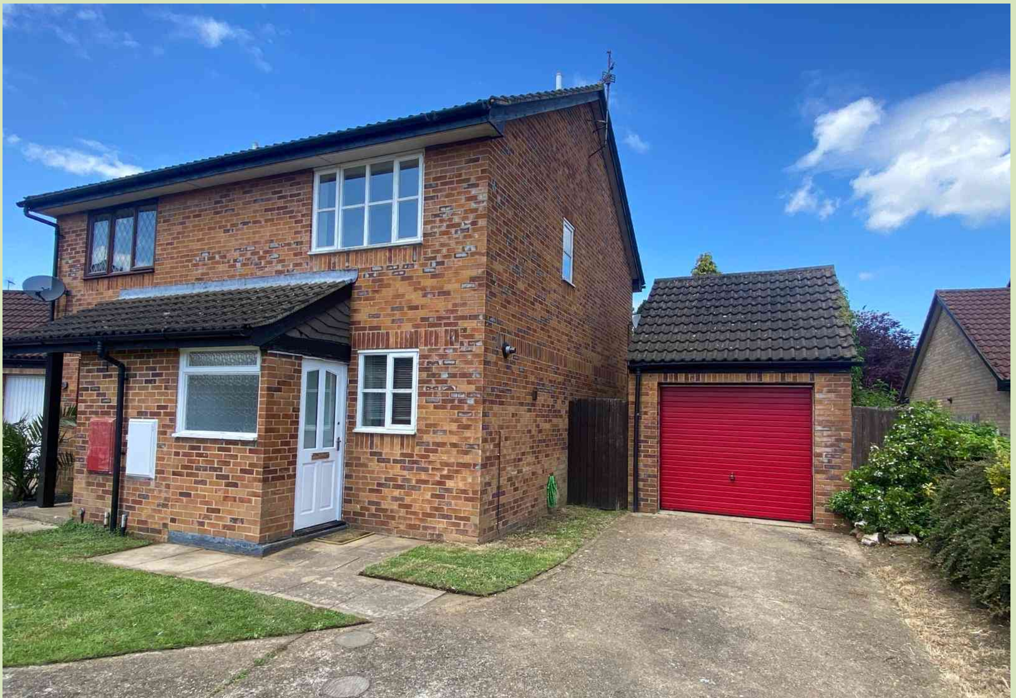
37 All Saints Drive, North Wootton Guide Price £209,950