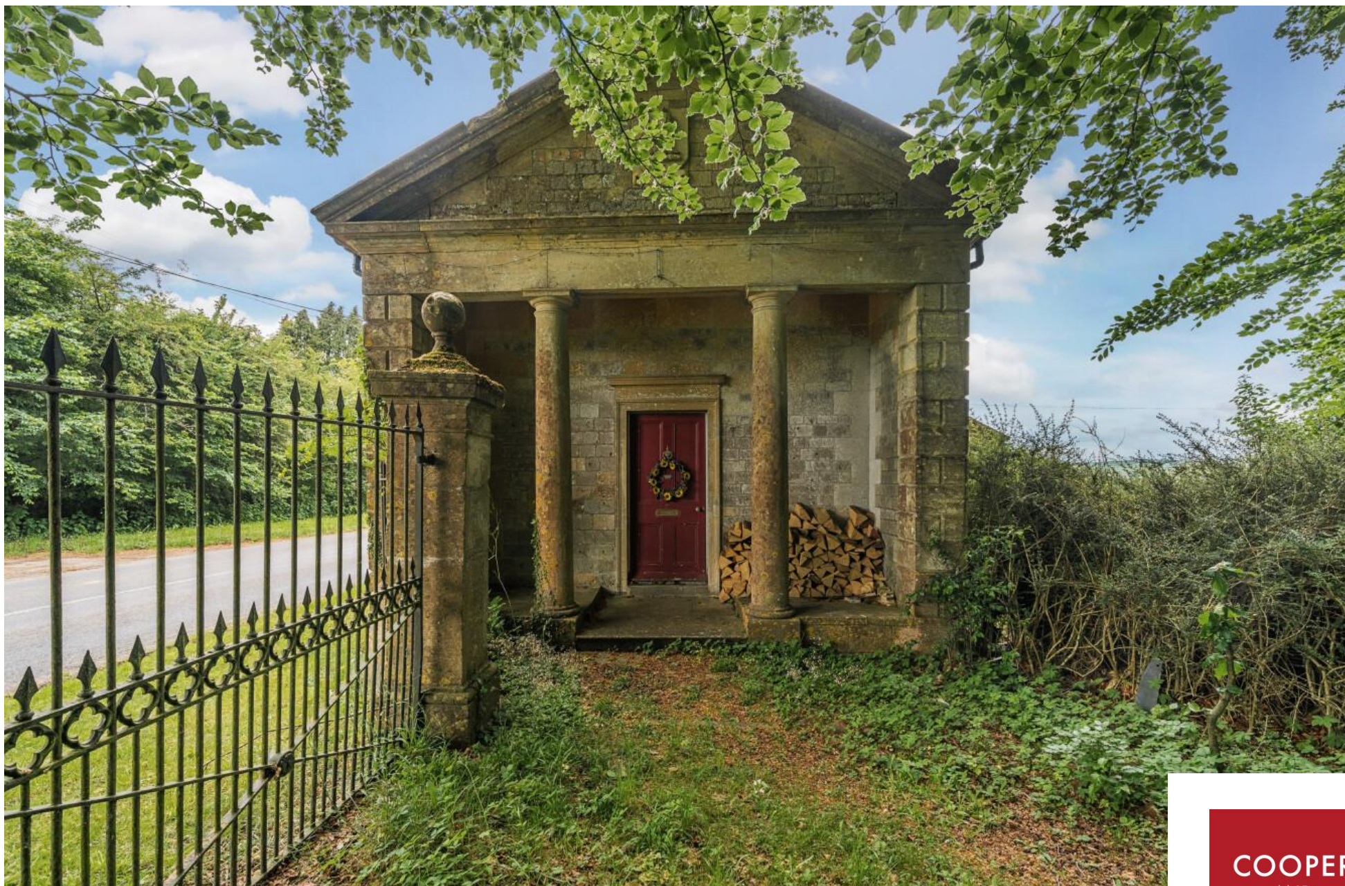
North Lodge, Sutton Veny, Warminster, Wiltshire, BA12 7BN