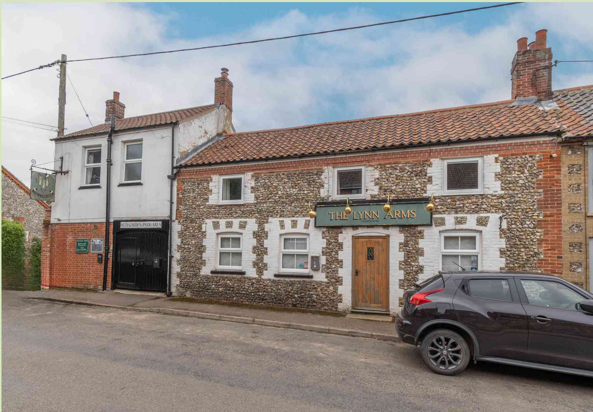
The Lynn Arms, Syderstone Guide Price £250,000