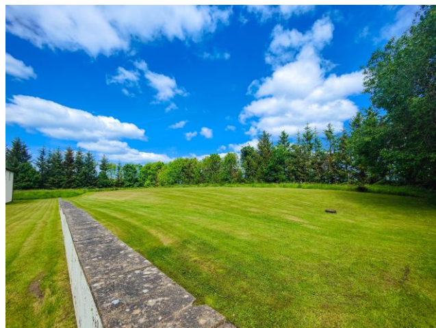
OUTLOOK TO THE REAR