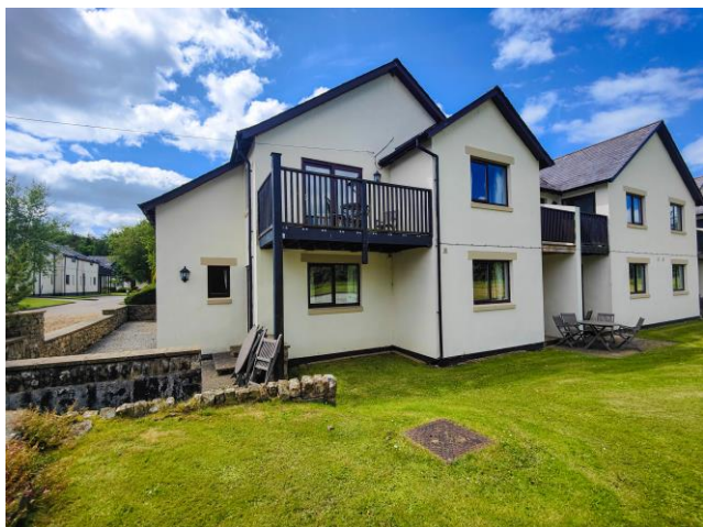
REAR OF THE PROPERTY

OUTSIDE Patio seating area leading to the communal lawned gardens. Low maintenance gravelled side garden leading round to an additional patio seating area at the front. The children's play park is a short walk away as is the car park.