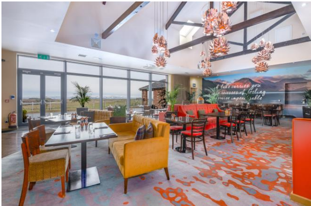
RESTAURANT & BAR