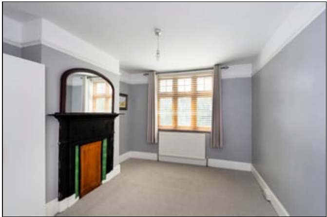
12' 0" x 10' 2" (3.66m x 3.10m) Double glazed window to front, radiator, cast iron fireplace.