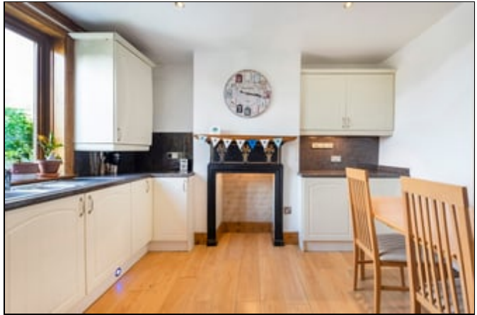
11' 8" x 10' 8" (3.56m x 3.25m) Fitted with wall and base units worktops, stainless steel sink unit,, double glazed window to rear, wood flooring, fireplace surround, radiator, cupboard housing boiler, electric oven, hob and extractor fan.