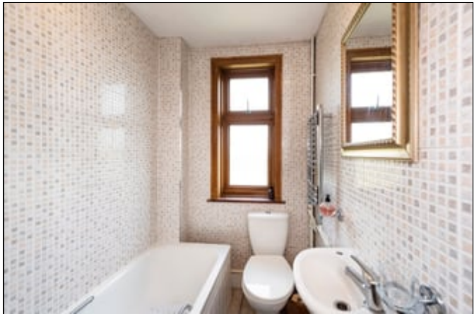
Fitted with a white suite comprising, panelled bath, low level W.C., wall mounted wash hand basin, tiled walls and floor, double glazed window to rear.