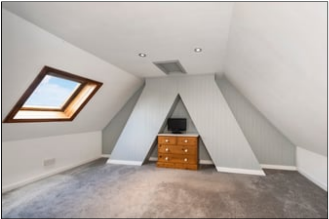
16' 4" x 13' 1" (4.98m x 3.99m) Two Velux windows, radiator, fitted storage cupboards.