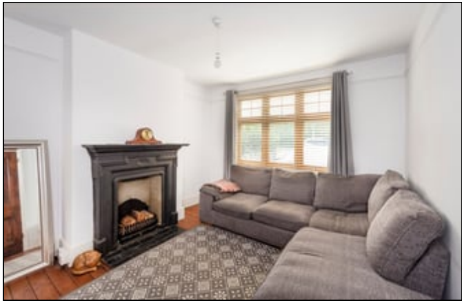
11' 10" x 10' 8" (3.61m x 3.25m) Double glazed window to front, radiator, cast iron Victorian fireplace, wood floor.