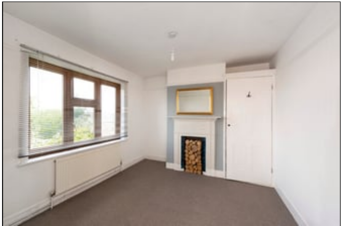
10' 10" x 10' 2" (3.30m x 3.10m) Double glazed window to rear, radiator, built in cupboard.