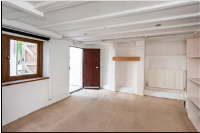
16' 0" x 11' 8" (4.88m x 3.56m) Double glazed window to rear, radiator, door to utility area.