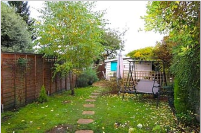
There is a lovely garden to rear mainly laid to lawn with workshop to rear 10'1 x 7'7 with storage 6'11 x 5'11 and paved patio.