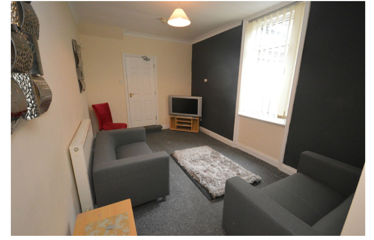
14' 9" x 9' 10" (4.50m x 3.00m) approx

Room is furnished with two large sofas, coffee table, TV stand and footrest. Leading to: