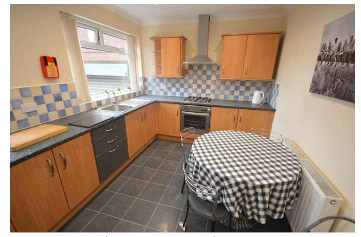
12' 10" x 9' 3" (3.91m x 2.82m) approx

Kitchen/Diner fitted with a stainless steel drainage sink and four ring gas hob over which there is a brushed steel filter hood. Other benefits include electric oven upright Lada fridge and separate freezer, tiled splash backs, display shelving, spotlighting, two free standing microwaves and other small appliances, vinyl flooring, table ideal for day to day living or entertaining purposes, two windows maximising natural light, spotlights and radiator.