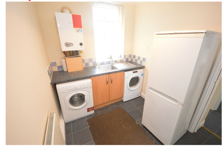
9' 7" x 6' 11" (2.93m x 2.10m) approx

Fitted with base units and laminate work surfaces over incorporating a stainless steel drainage sink with chrome mono bloc tap fitting, also including washing machine, separate tumble, dryer Lada fridge freezer, vinyl flooring and door leading into: