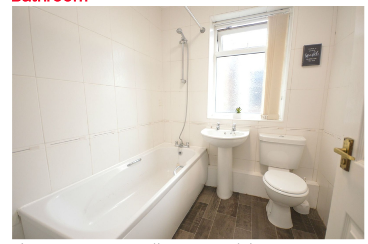
Shower Room/Toilet comprising a separate shower unit, hand basin, toilet, vinyl flooring, mirror, window and towel rail.