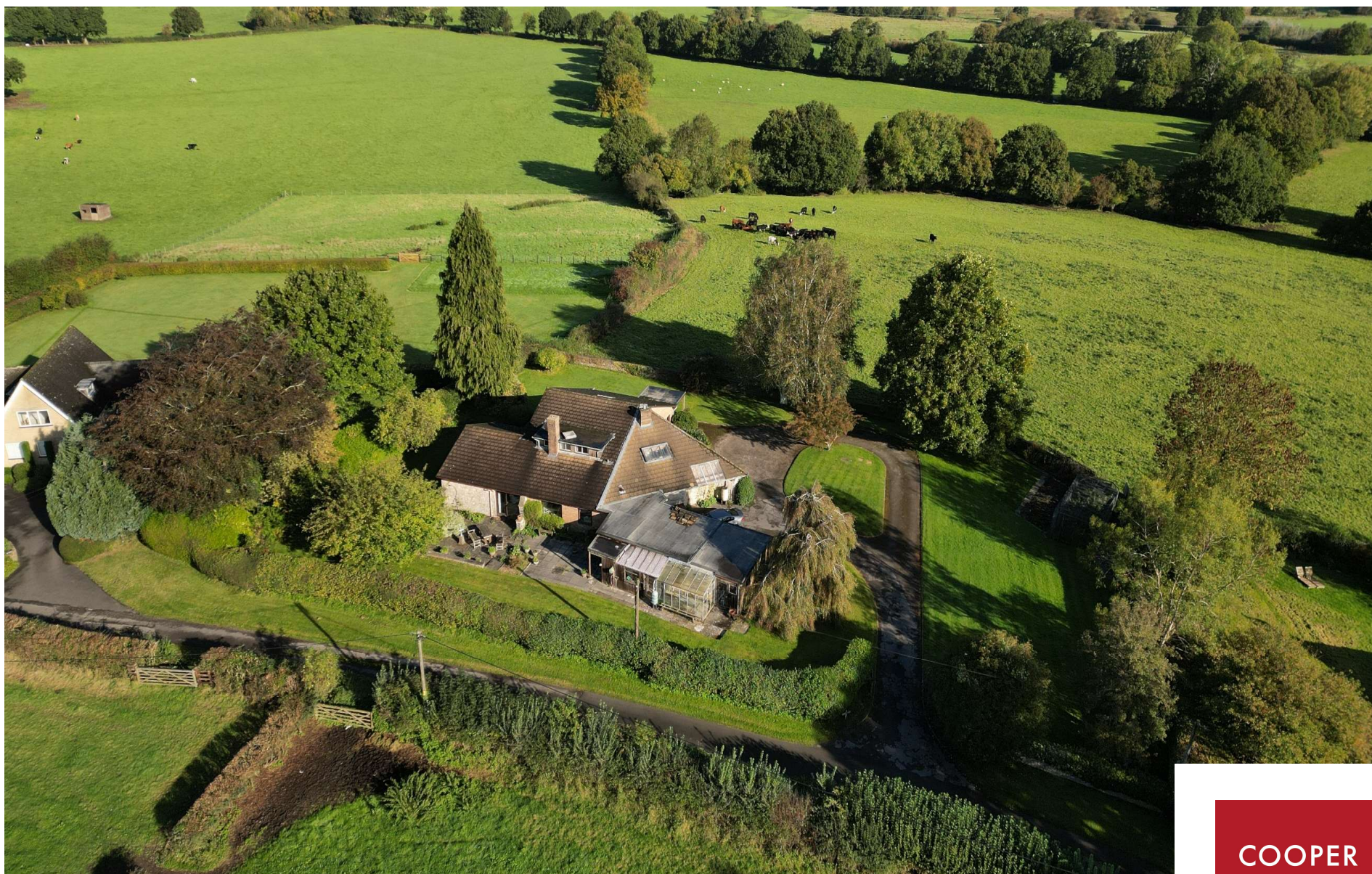
Orchard House, Court Lane, Corsley, BA12 7PA Guide £950,000 - £975,000 Freehold