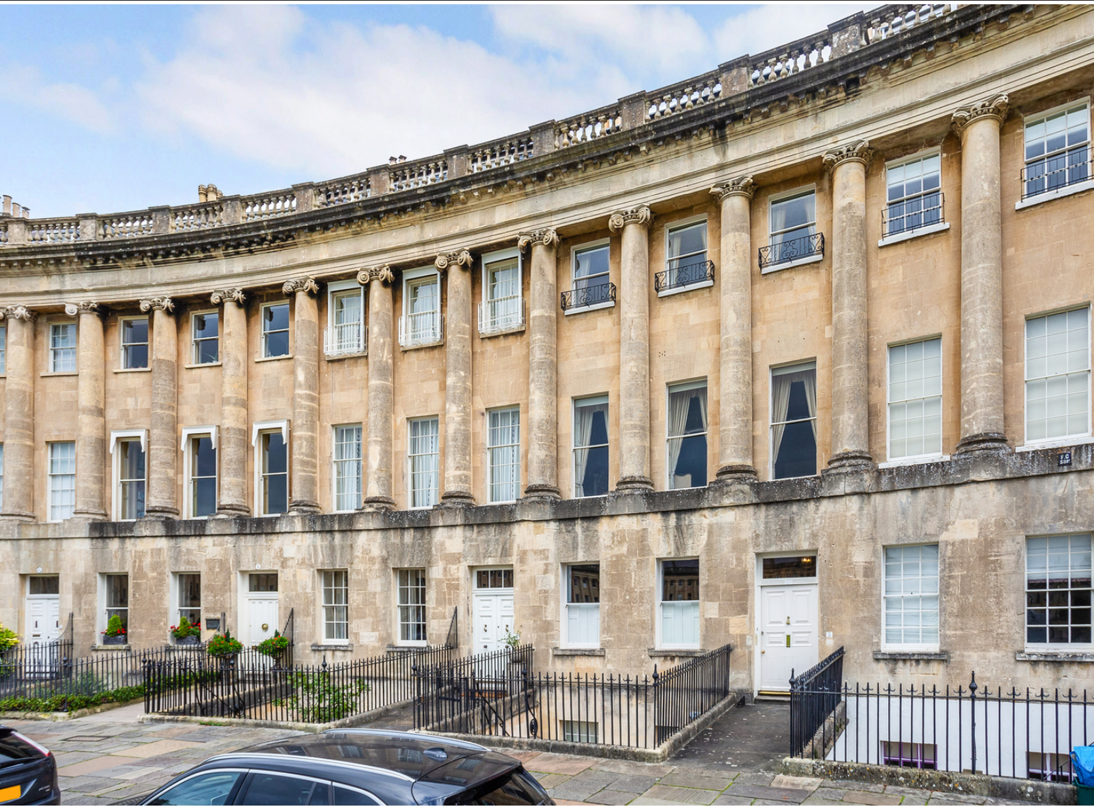
Royal Crescent, Bath