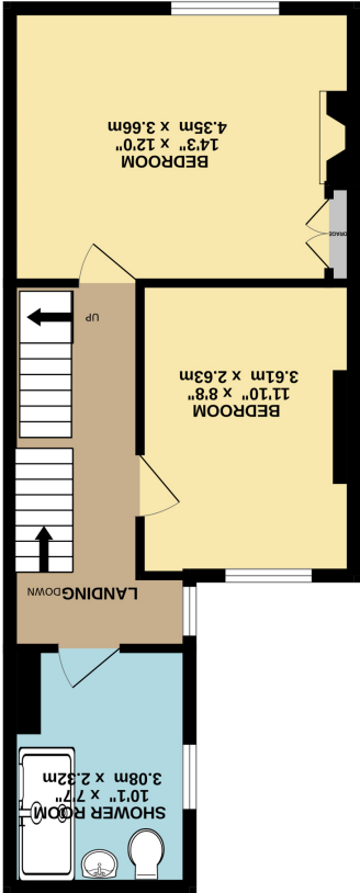
1ST FLOOR 440 sq.ft. (40.8 sq.m.) approx.