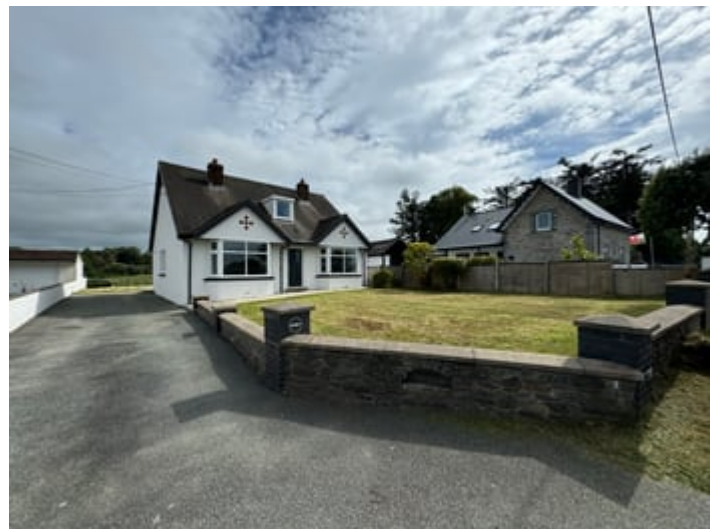
The property is approached from the adjoining county road onto a tarmacadam driveway with space for 3+ vehicles to park and front lawn area with walled forecourt and footpath leading to the rear of the house.