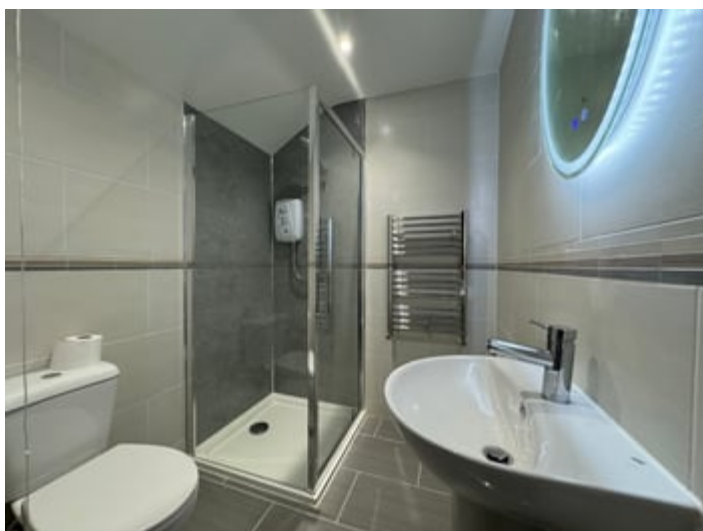
5' 4" x 5' 9" (1.63m x 1.75m) 5' 4" x 5' 9" (1.63m x 1.75m) enclosed tiled corner shower unit with waterfall head, single wash hand basin, WC, heated towel rail, fully tiled walls and flooring, light up mirror, spotlights to ceiling.