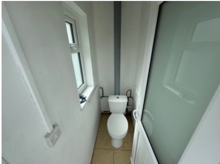
WC, side window.