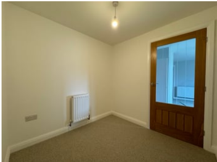
7' 4" x 7' 3" (2.24m x 2.21m) Walk-in dressing via glass door, radiator, multiple sockets.