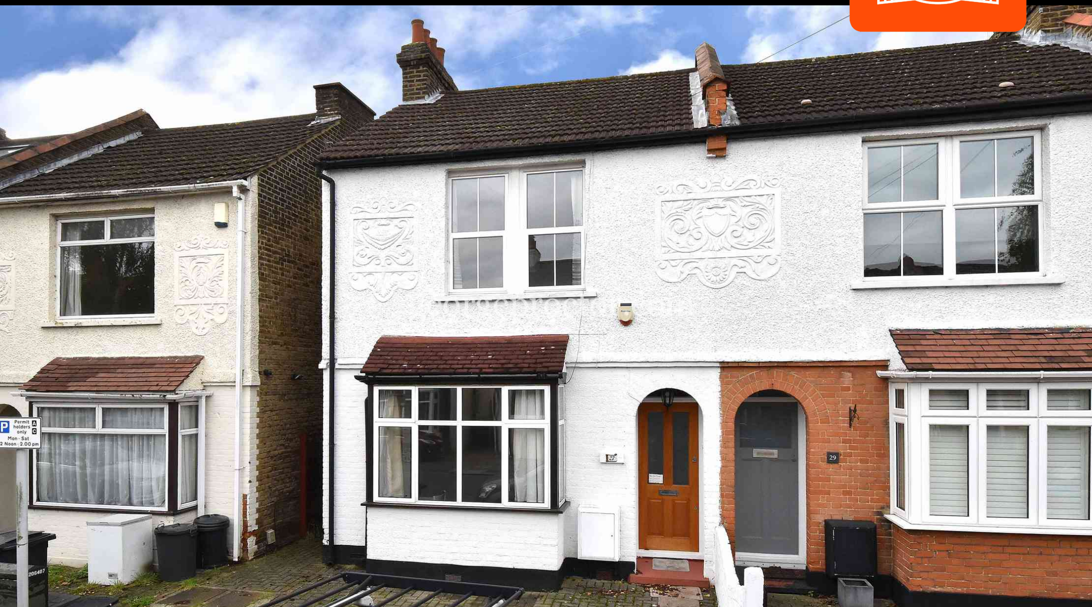
Haywood Road, Bromley, Kent. BR2 9RG