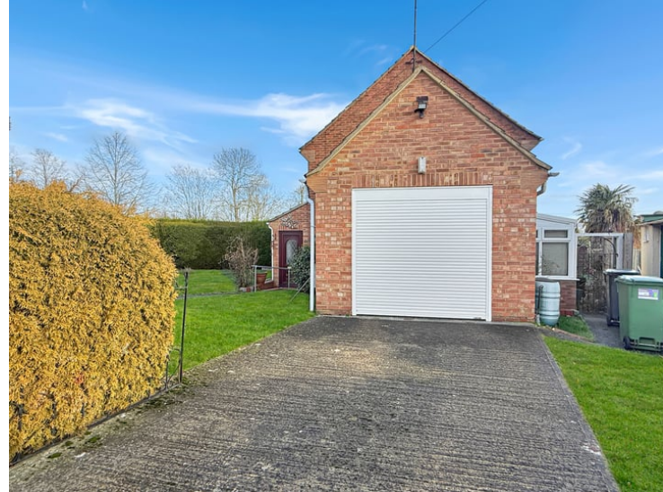
Garage With Electric Roller Door