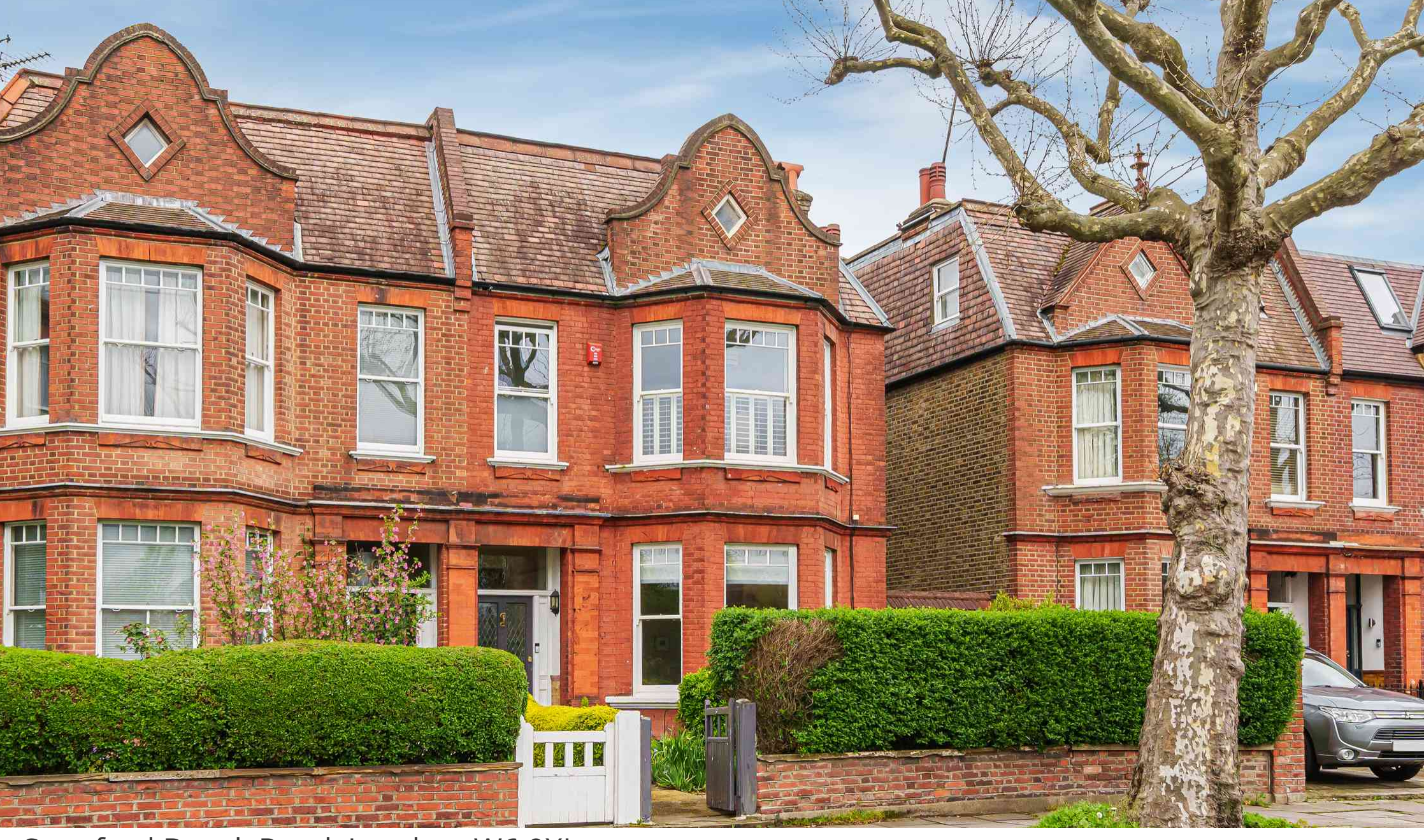
Stamford Brook Road, London, W6 0XL