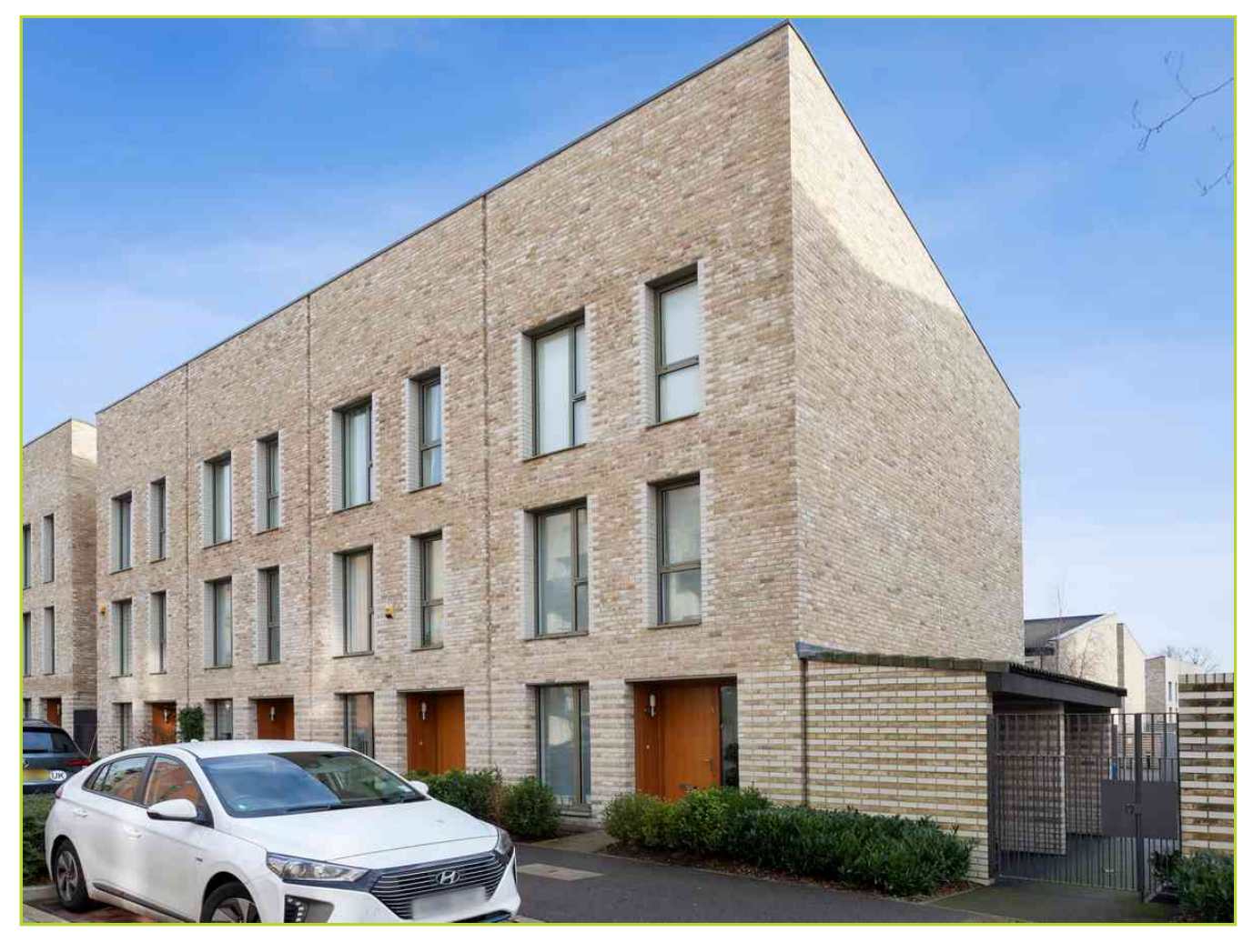
Lacey Drive, Edgware. HA8 8FZ. £749,950 Leasehold

Recently Built 4 Bedroom End Of Terrace Townhouse is offered with high specification throughout and comprises a bright modern fitted kitchen/dining area, utility room, main reception on the 1st floor, additional study on ground floor, two bathrooms (one en-suite), guests cloakroom, reserved off street parking, rear garden and a high level of storage facility throughout including the loft. Located in a highly desirable location on a quiet residential street, just a 2 minute walk from local shops and a 10 minute walk from Stanmore train station. 20 min from Edgware train station.