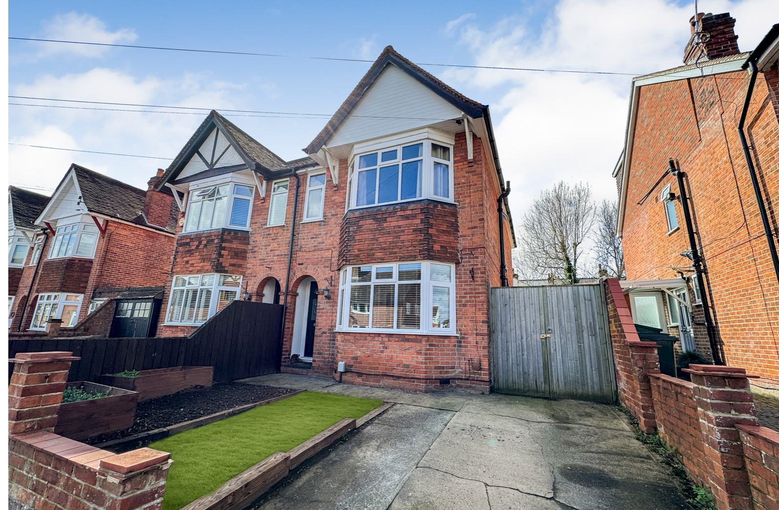
Drayton Road, Reading, Berkshire.