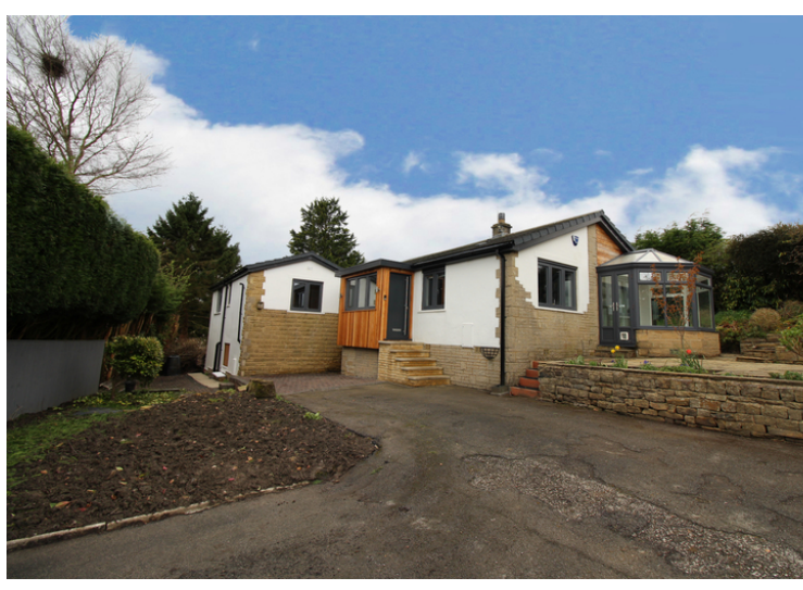
Offers in the region of £399,995