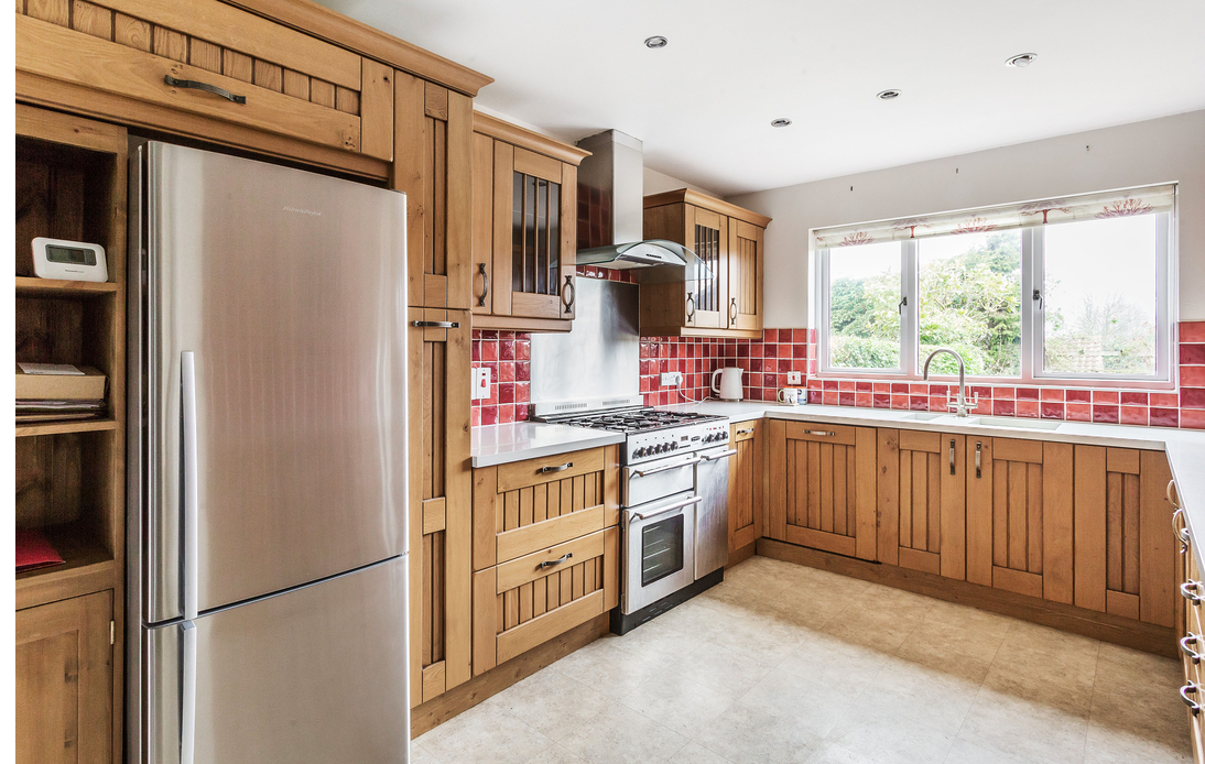
8 Padbrook, Oxted, Surrey RH8 0DW £900,000 - Freehold