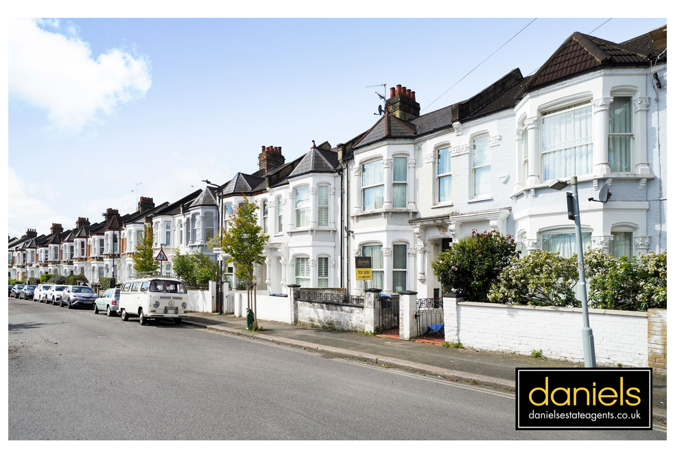
Linden Avenue, KENSAL RISE, LONDON NW10 5RL £1,150,000 - Freehold