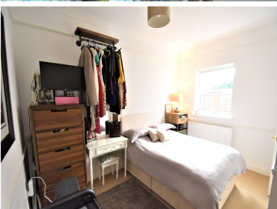
PRICE £325,000 Share Of Freehold