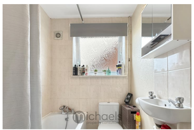
Low level W.C, panelled bath with shower attached, radiator, vanity wash basin.