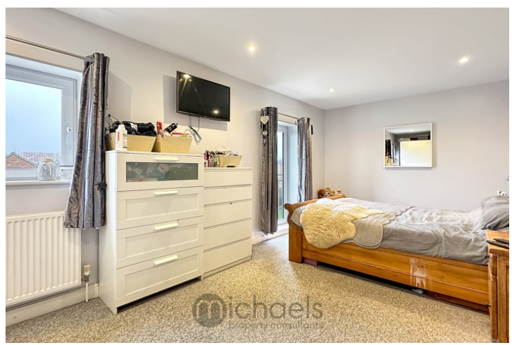
19' 2" x 9' 9" (5.84m x 2.97m) UPVC window to rear aspect, Juliette balcony to rear, radiator, spot lights, space for wardrobes.