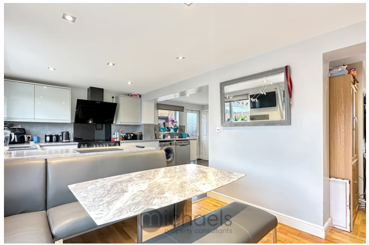
10' 5" x 9' 5" (3.17m x 2.87m) UPVC French doors leading out to garden, radiator, wood effect flooring, spot lighting, access into: