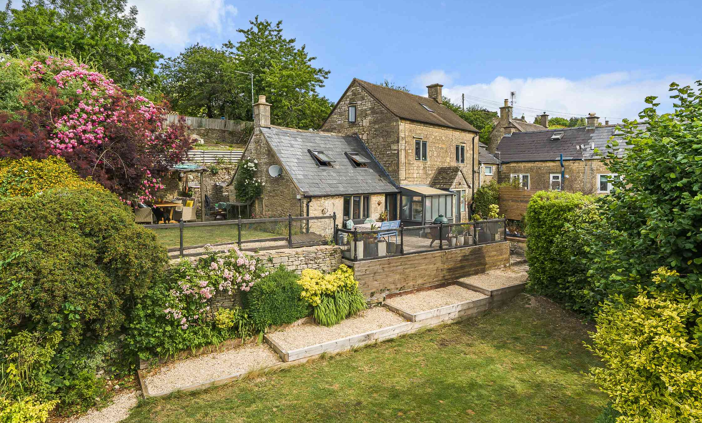
Walton Cottage, Silver Street, Chalford Hill, Stroud, GL6 8ES Guide Price £660,000