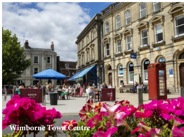
Wimborne Town Centre