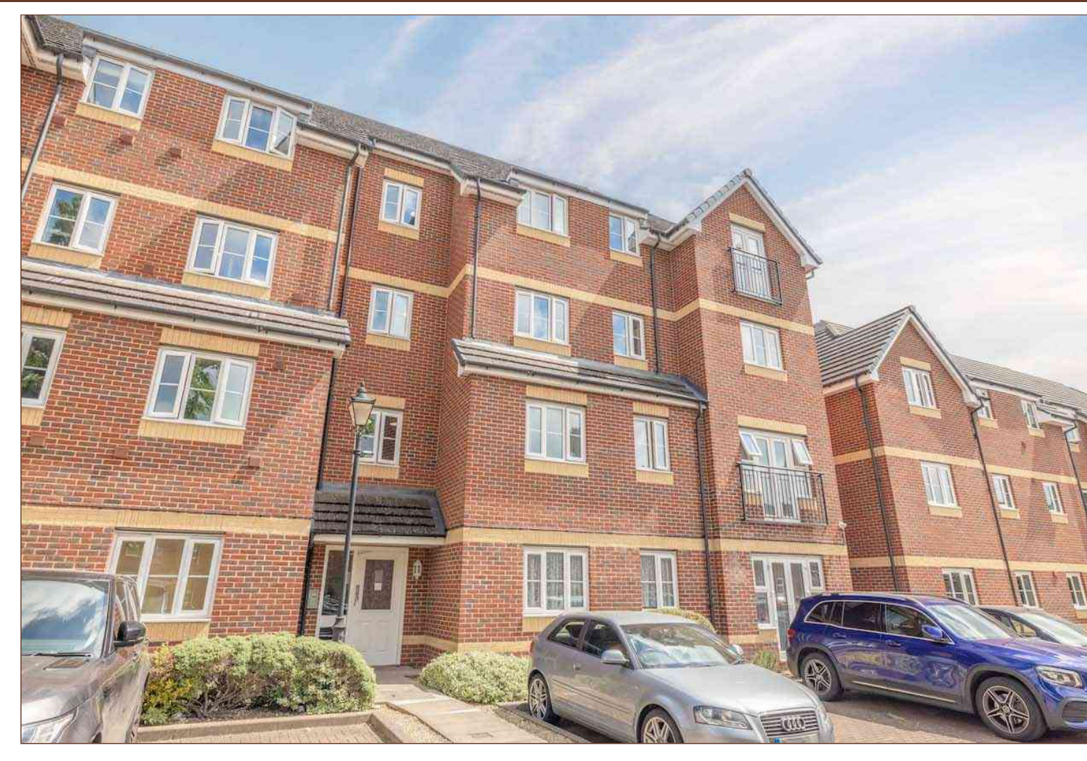
This TWO bedroom second floor apartment is located perfectly for all commuters with easy access to excellent transport links.

Comprising of TWO spacious double bedrooms with the master bedroom benefitting from an en suite bathroom, large open plan living / dining area with access into the kitchen. A second well maintained family bathroom is also on offer. With large windows all over this apartment is completely flooded with natural light providing that open and welcoming feeling all throughout.