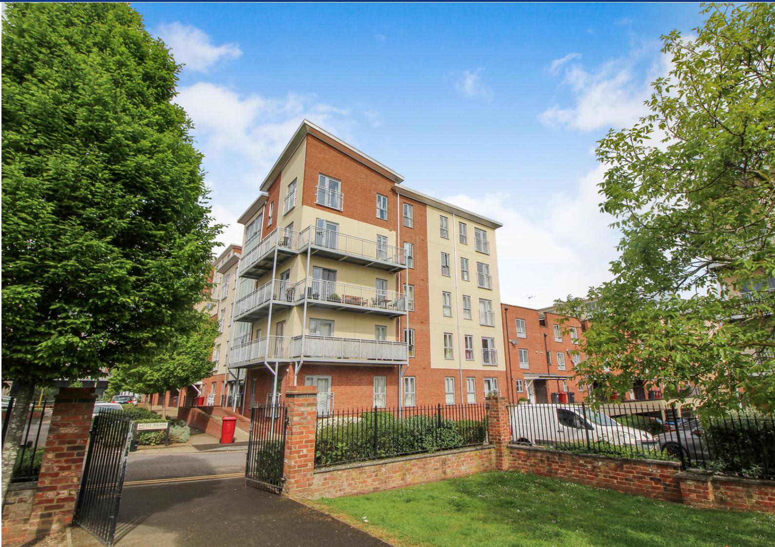
Sourton House, Battle Square, Reading.